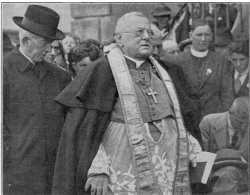
THE BISHOP OF TRURO DEDICATING THE PADSTOW LIFE-BOAT.