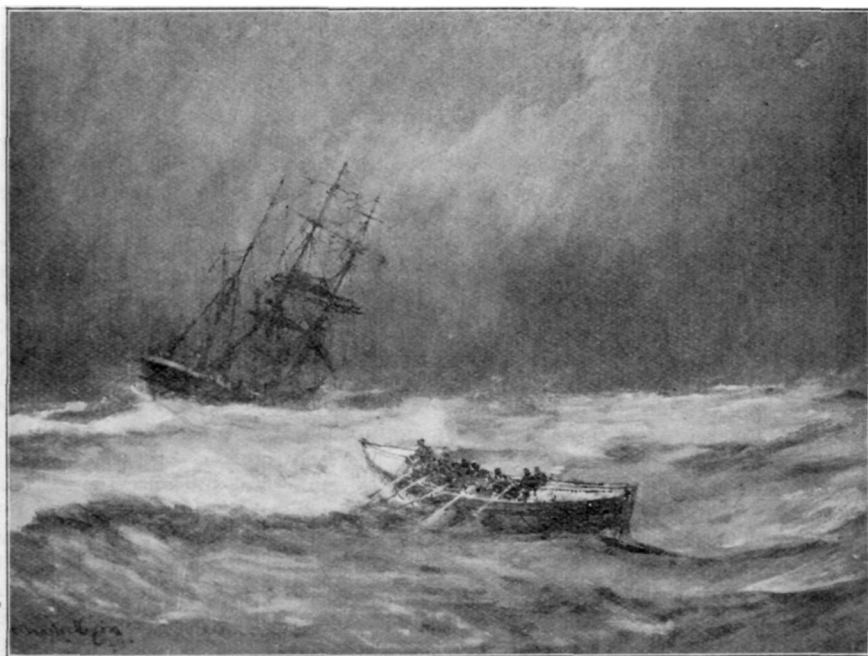
At the Height of the Storm.