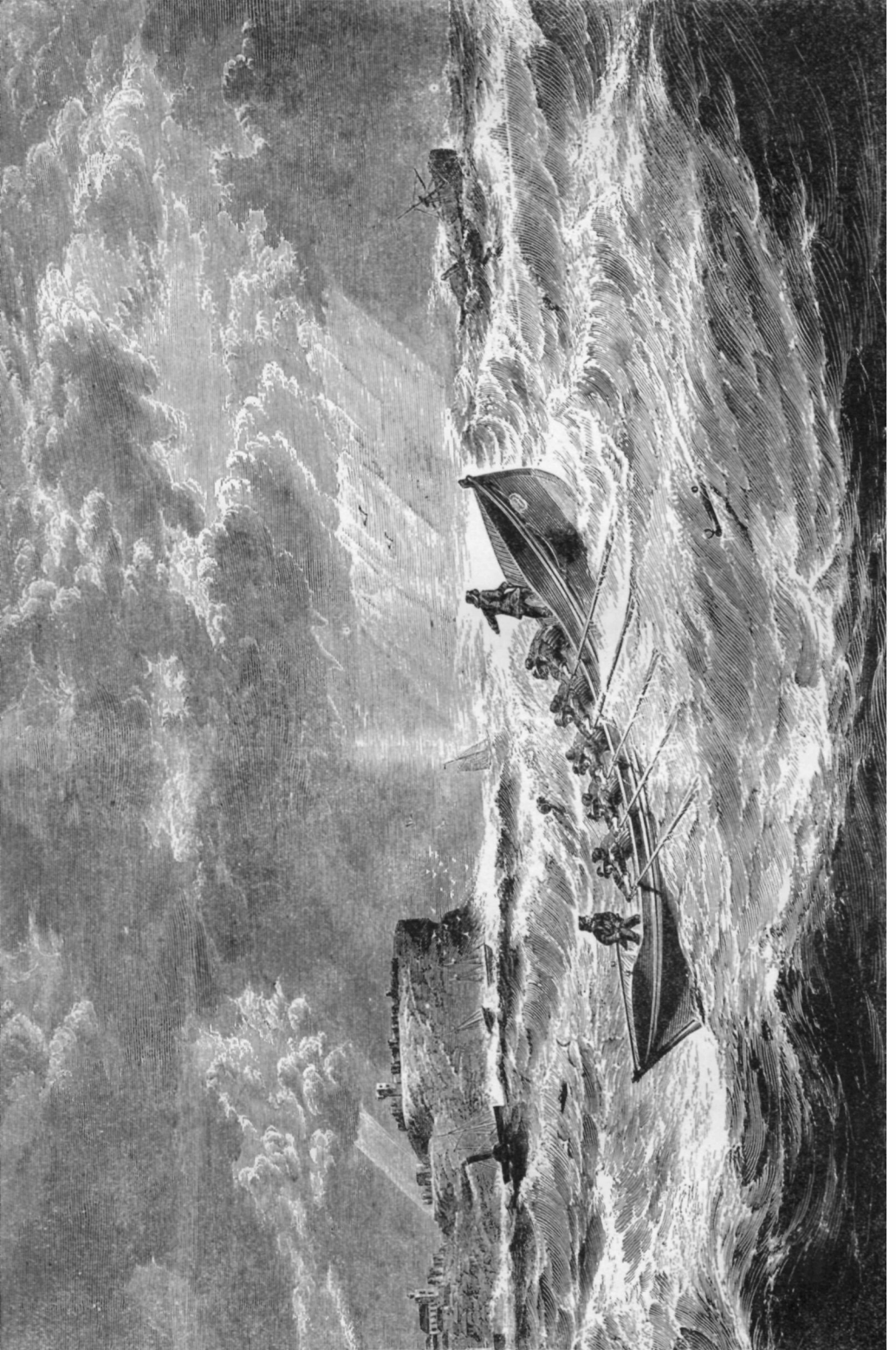
THE LIFE-BOAT GOING OFF TO A WRECK.