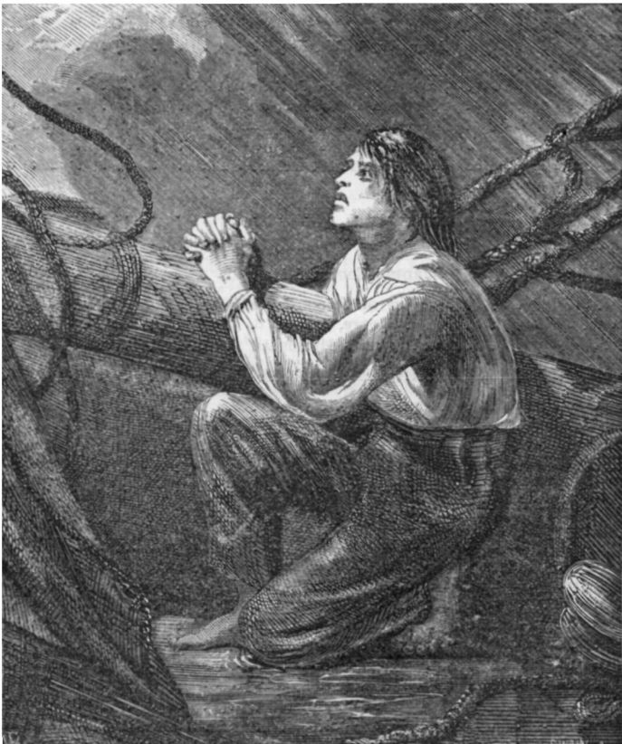
GOD HELP OUR MEN AT SEA.